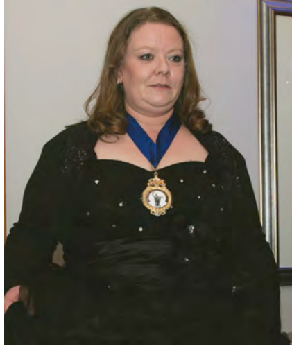
The President addressing guests at the Annual Dinner